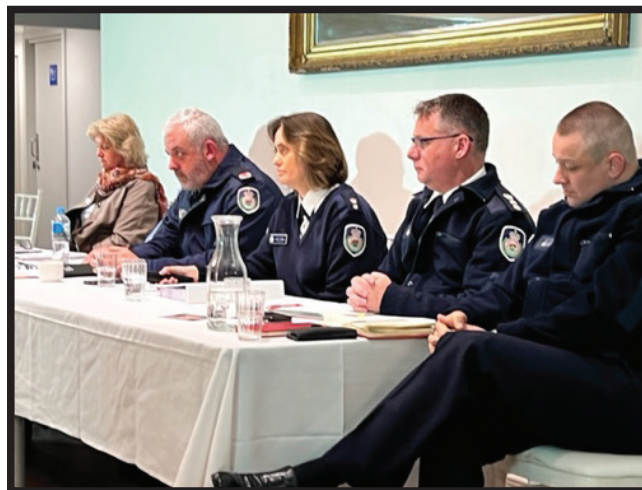
Photo: RFS meeting with residents to hear concerns about escaped Mt Wilson back burn at Berambing.

If you are concerned for yourself or others, you can contact the Mental Health Line 1800 011 511.