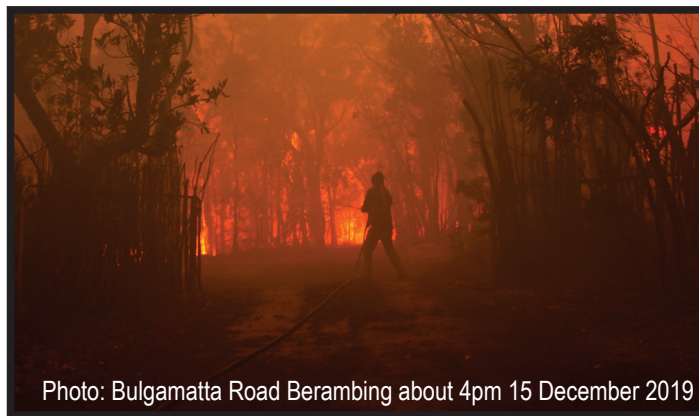
Photo: Bulgamatta Road Berambing about 4pm 15 December 2019

The group made a public submission to the Coroner in May 2022 that can be viewed at www.mtwilsonbackburn.com . This submission uses RFS documentation to detail a chronology of events starting with the lighting of the backburn on 14 December 2019 at 9:58am at corner of Bells Line and Mt Wilson roads and the fire escaping containment lines 5 hours later; to a request from the fire ground the next day Sunday 15 December 2019 at 12:49pm for an upgrade of the warning level to Emergency which was denied; then