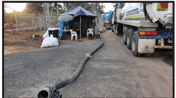
Photo: Poo trucks lined up waiting to plug into sewer pipe and truck turds to treatment works

At the moment whether everyone will be slugged with the turd tax or if it will be limited to the makers of the poo is anyone's guess.