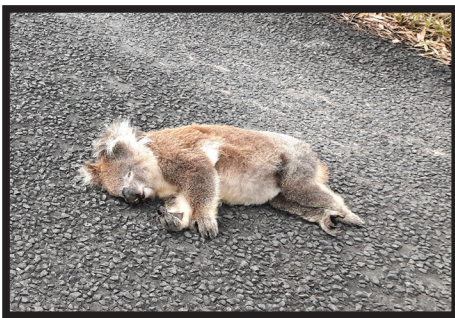
Photo: Dead koala found on Mt Lagoon Rd

For the first time in living memory, which is over half a century, a koala was found dead on the carriage way of Mt Lagoon Road, apparently killed by a passing vehicle. Another Koala body, reported on Facebook, was found on Bells Line Road at Kurrajong Heights.